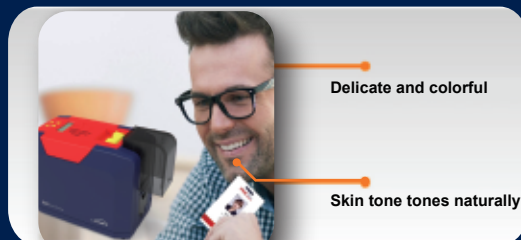
High quality photo processing by Dye sublimation technology

Dual interface card encoding module Contactless ID Card encoding module UHF chip card encoding module Magnetic stripe card encoding module